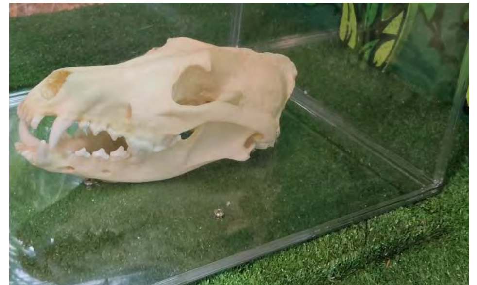
HERBIVORE AND CARNIVORE SKULLS