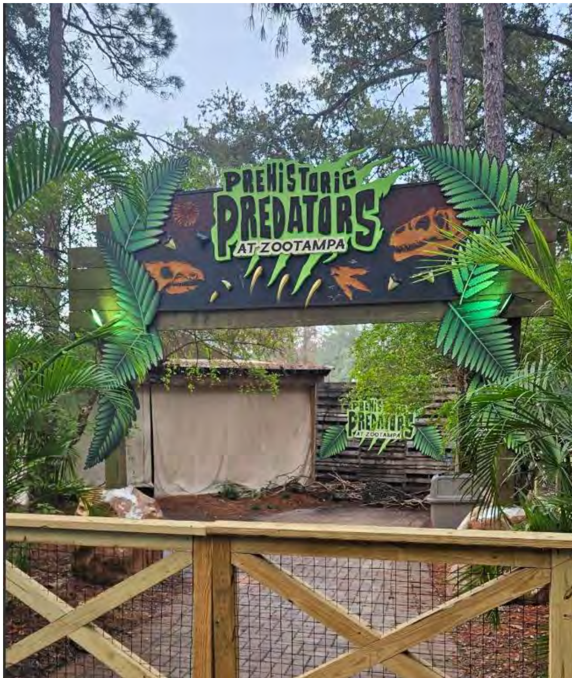
ENTRANCE INTO PREHISTORIC PREDATORS